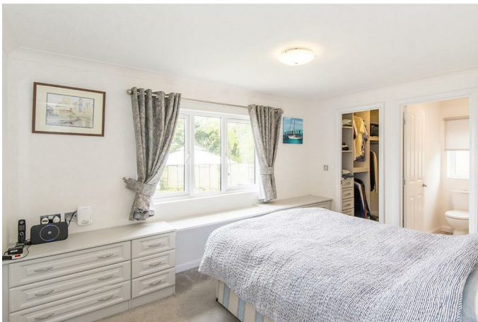
Bedroom One 9'4" x 12'5" (2.84m x 3.78m)