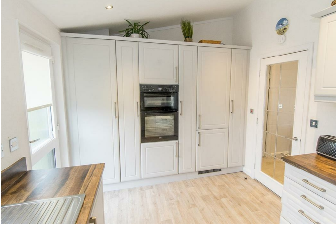
Kitchen Photo Two