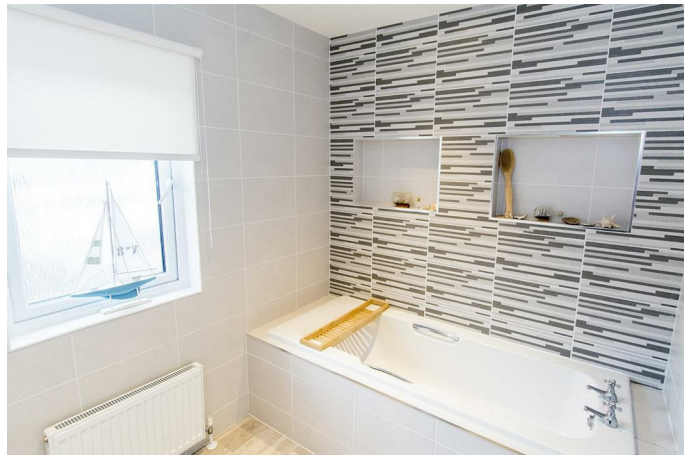
Bathroom Photo Two

Fitted with a back to wall WC, wash hand basin set onto a vanity unit, bath, ceramic wall tiles and luxury vinyl flooring, radiator and an opaque window to the side aspect.