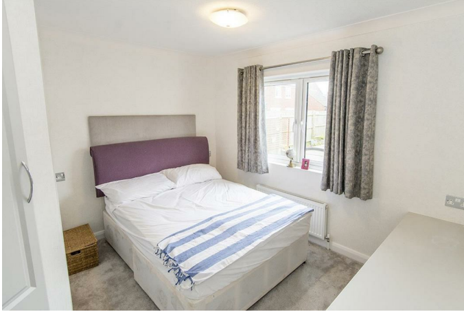
Bedroom Two 9'4" x 10'4" (2.84m x 3.15m)

A double bedroom with fitted wardrobes, radiator and a window to the side aspect.