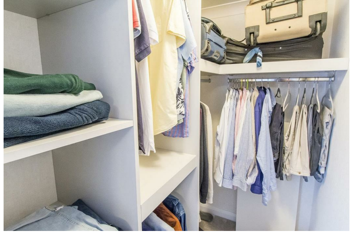
Dressing Room 4'2" x 6'2" (1.27m x 1.88m)