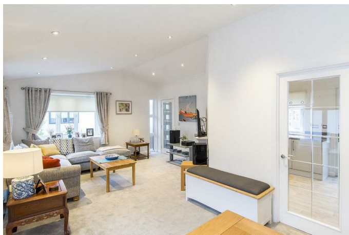
Lounge Diner 13'11" (max) x 21'2" (4.24m (max) x 6.45m)

This spacious bay- fronted lounge diner has a feature fireplace housing an electric pebble effect fire, dual aspect windows to the side and two radiators. There is ample space for a full sized dining table which is the ideal space to entertain friends and family. A glazed door opens into the kitchen.