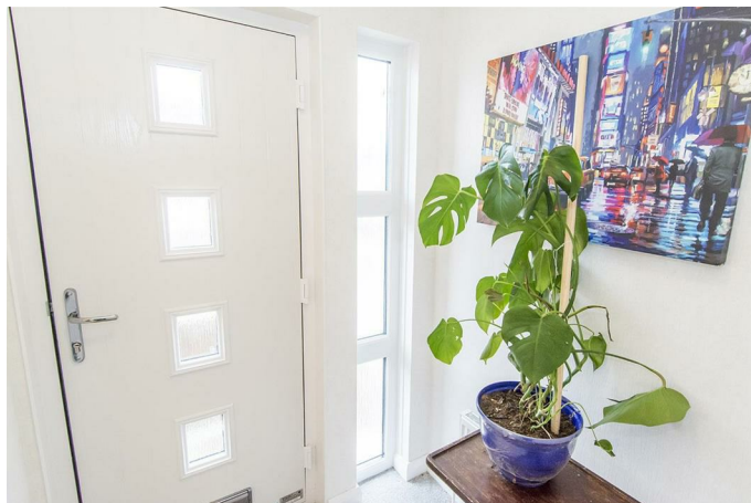
Entrance Hall 6'3" x 4'11" (1.91m x 1.50m)

Enter into this lovely home via a composite door where you will find a generous cloak cupboard and a radiator. A glazed door opens into the lounge and dining room.